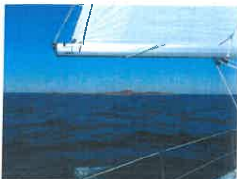
Single Linne Reef & Lazyjack