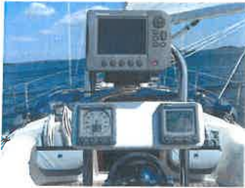
Integrated nav instruments with AIS information