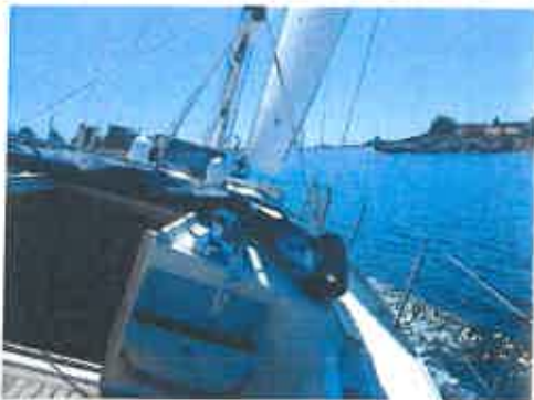
Pulled down halyards and reefs