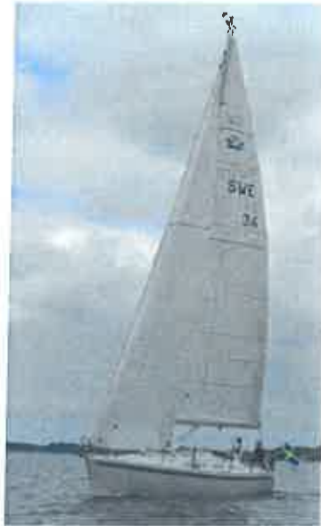
Self-tacking jib with glider batten