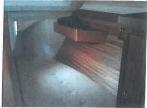
Port: Aft cabin with double berth and wardrobe