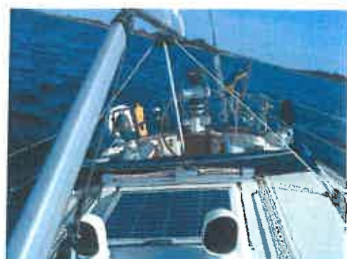
Solar panel, traveller and rodkick with gas lift