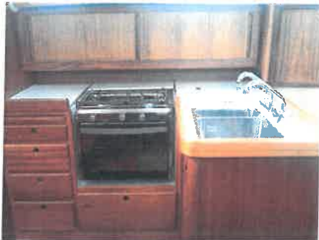
Galley with W/C-water, sea-water, cooling and gas stove