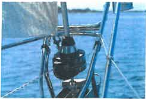
Furlex and bow ladder