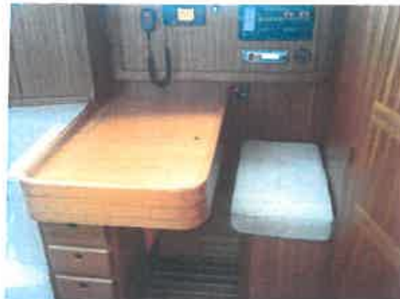
Chart table with electric panel, AIS, VHF-DSC, Navtex, FM/CD