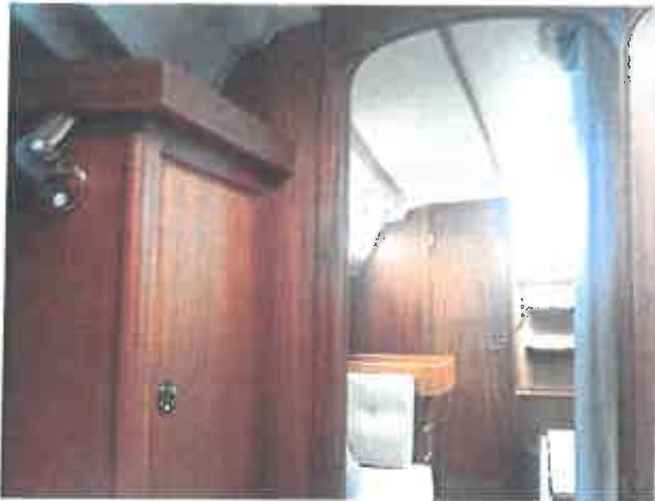
Forward cabin with double wardrobes