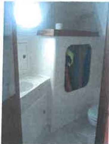
Starboard: WC with shower and oilskin locker