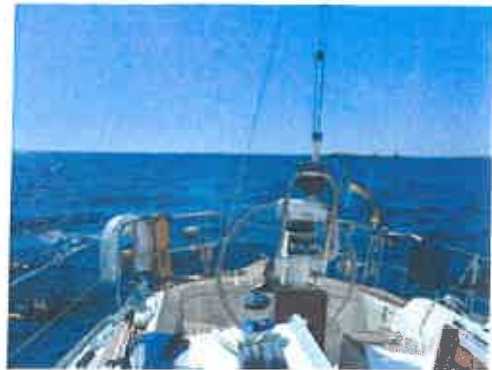
Cockpit with speakers and fold-up table