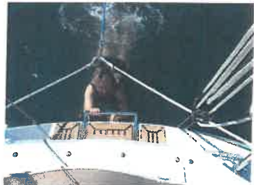
Transom with bathing and shower