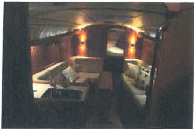
Warm and cozy main cabin with good of stowage